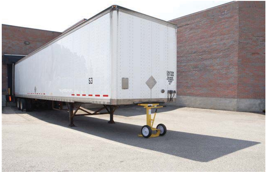
EZ-Riser Trailer Stand

The easiest, most convenient, and safest Trailer Stand on the market.